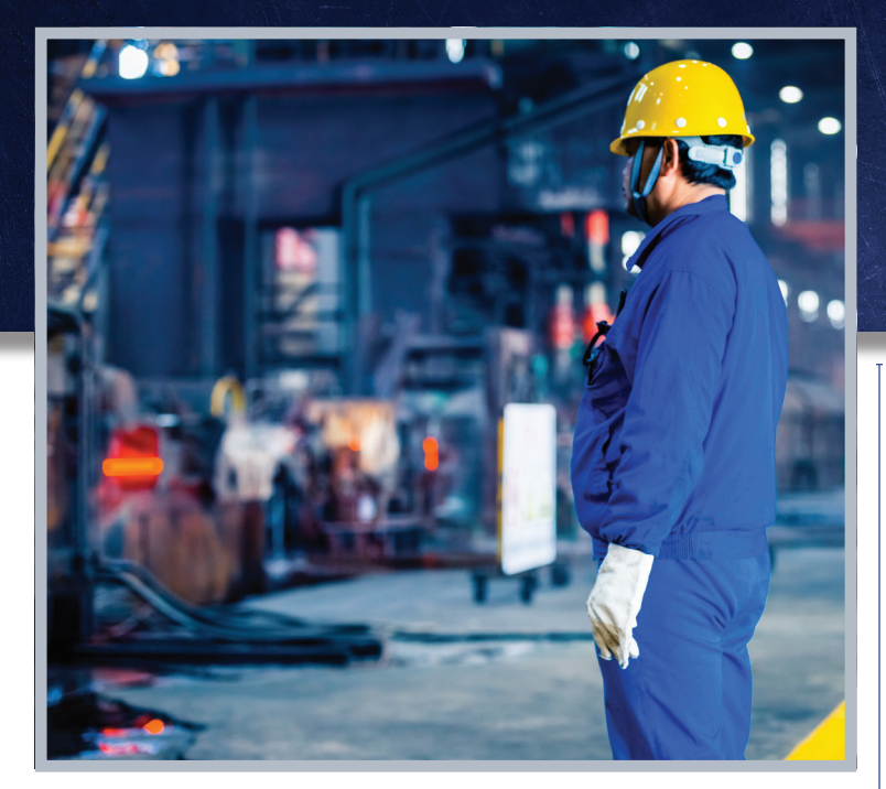
Part 85. The Control of Hazardous Energy Sources . Rule 1910.147(c)(4)(I). Energy Control Procedure. Procedures shall be developed, documented and utilized for the control of potentially hazardous energy when employees are engaged in the activities covered by this section. Average citation: $4,968